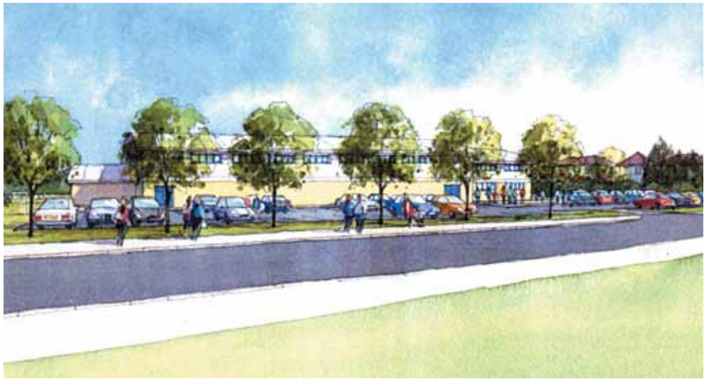
VIEW OF QUINTA DEVELOPMENT FROM MAYS LANE

In our previous proposal, we outlined plans for a football academy and sporting centre of excellence at Copthall. We have now combined these plans with those for the new training facility at the Quinta site in Mays Lane. The potential benefits for the community as a whole (also outlined in detail in the previous document) are enormous, and become particularly attractive when considered in the light of the current derelict condition of the buildings and the poor state of the pitches at the site.