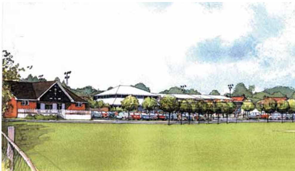
VIEW OF UNDERHILL FROM THE SOUTH AFTER COMPLETION OF IMPROVEMENTS